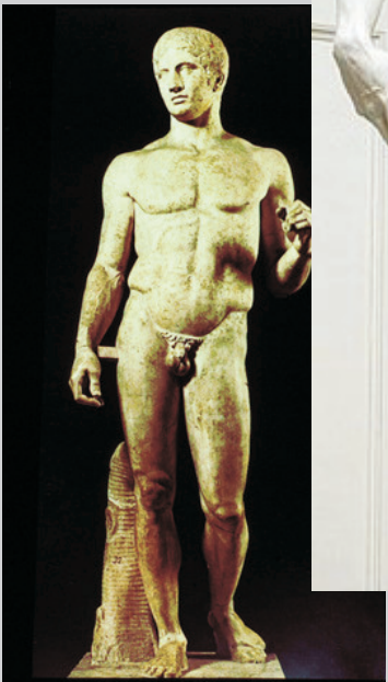
Greek Spear-bearer, 440 B.C.

The work depicts such classical characteristics as a full body nude and contrapposto pose (standing with most of its weight on one foot so that its shoulders and arms twist off-axis from the hips and legs) which was an important sculptural reintroduction of the human body used to express a psychological disposition.