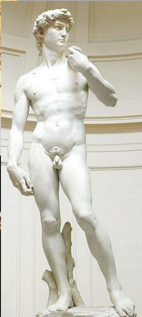
Michelangelo, David, 1504.