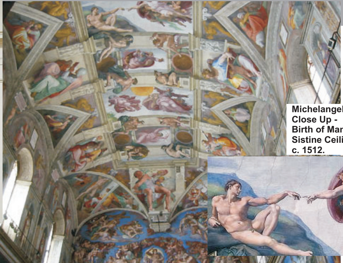
Michelangelo, Close Up - Birth of Man, Sistine Ceiling, c. 1512.

Pope Julius II commissioned him to paint the ceiling of his personal Sistine chapel. The chapel was 40 meters in length, and it took him 4 years to paint.