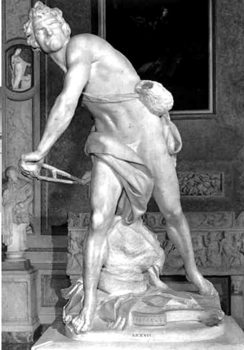
Bernini, David, Rome, 1660.