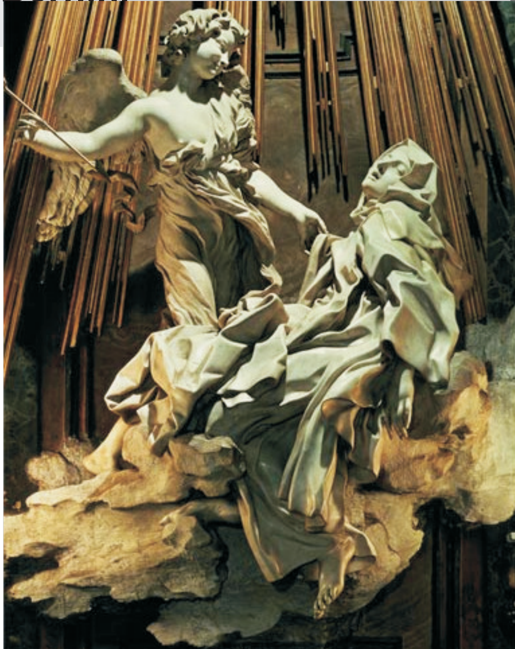
Giovanni Lorenzo Bernini, Ecstasy of St Theresa, 1652 (Marble)