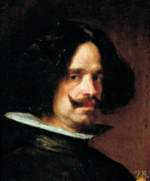
Velázquez, Self-Portrait, 1643.