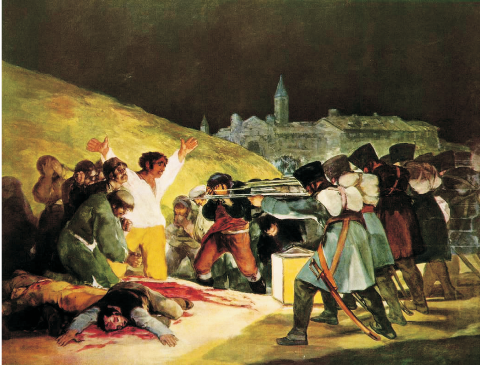
Francisco Goya, Third of May, 1814.

Goya's work commemorates the uprising of the Spanish people of Madrid after the French had occupied the city. On May 2nd, 1808, people had gathered in anger before the royal palace. They had heard the children of the king were to be taken to France. A fight broke out, and Spanish civilians and French soldiers were killed.