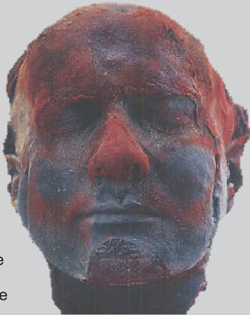
Marc Quinn, Self , 1991.

Quinn is famous for his use of the body—usually his own—and body function to make original and provocative sculpture. In 'Self' he constructs a cryogenic sculpture of his head cast with eight pints of his own frozen blood. His work has continued to challenge the notion of the self-portrait and to examine ideas of humanity.