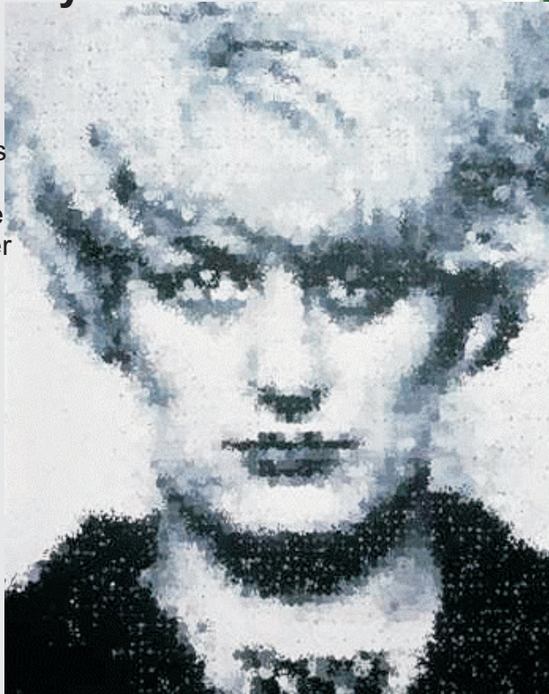
Marcus Harvey, Myra, 1998.

His most controversial work is a portrait of Myra Hindley , a notorious moors child killer, imprisoned for life in 1966 for murder and torture of 5 children. In his work he depicts the Moors murderer by using stenciled hand prints of children. When first exhibited in England the painting was splattered with ink and eggs and finally had to be put behind glass.