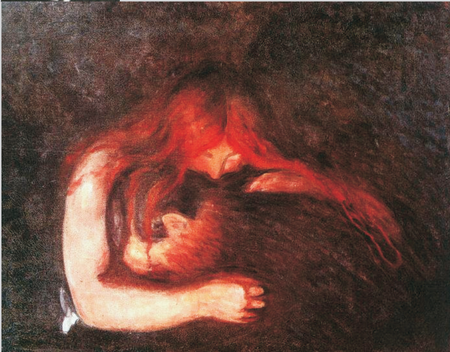
Edvard Munch, Love and Pain, 1894