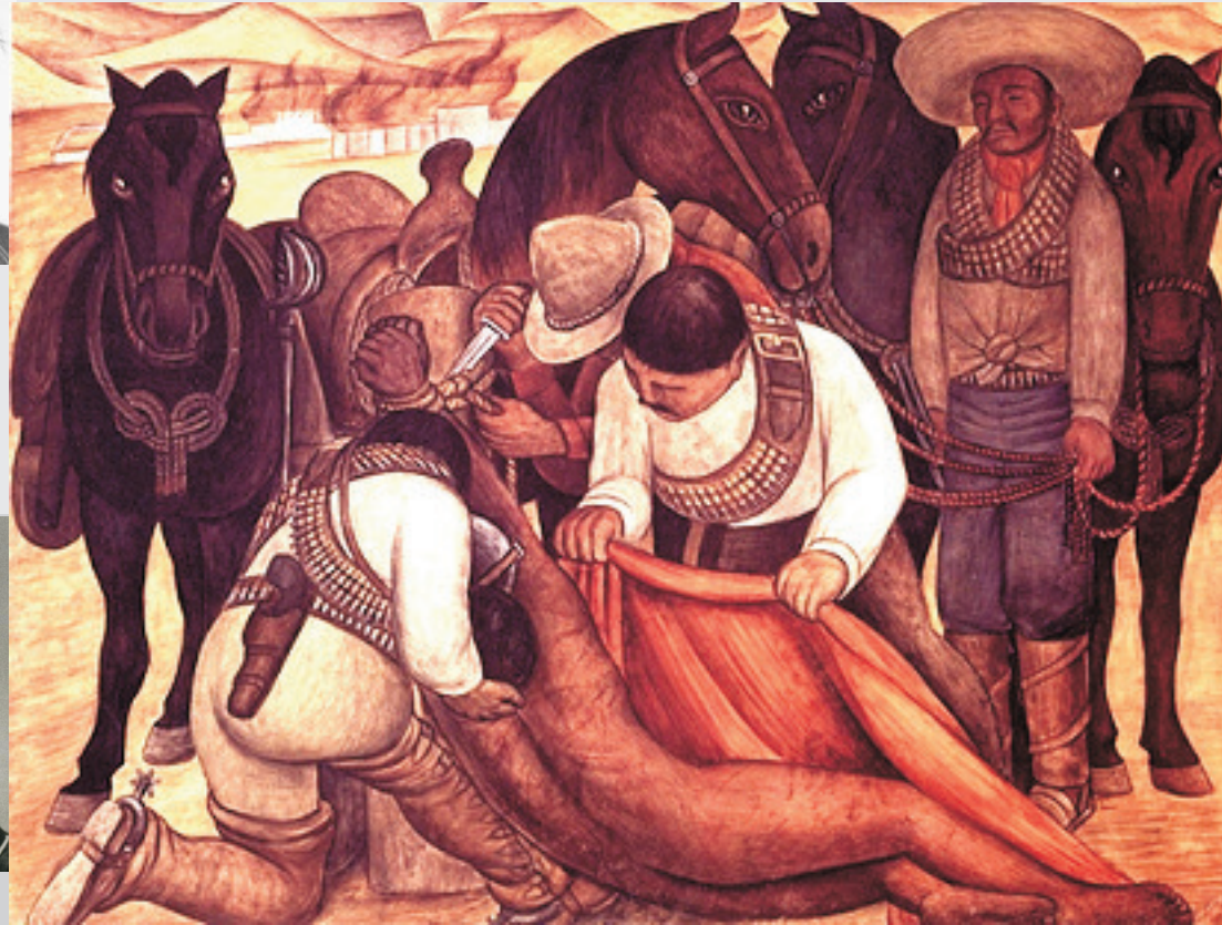
Diego Rivera. Liberation of the Peon, 1931.