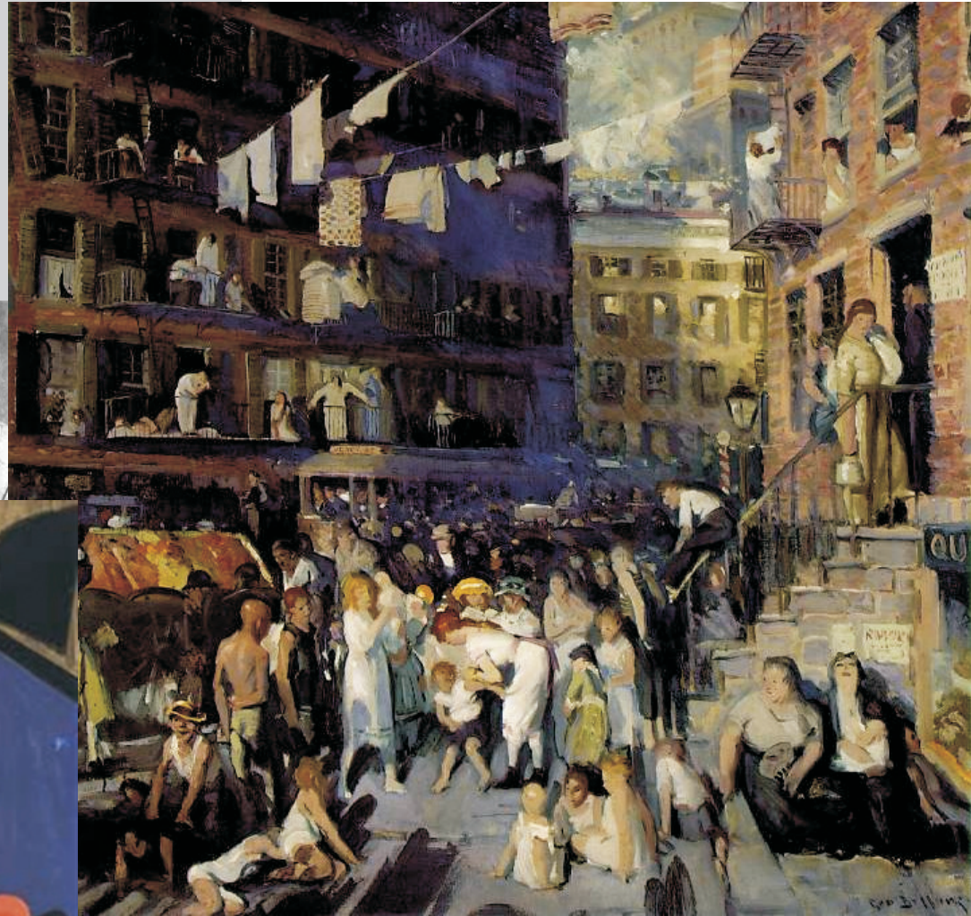
George Bellows, The Cliff Dwellers , 1913.