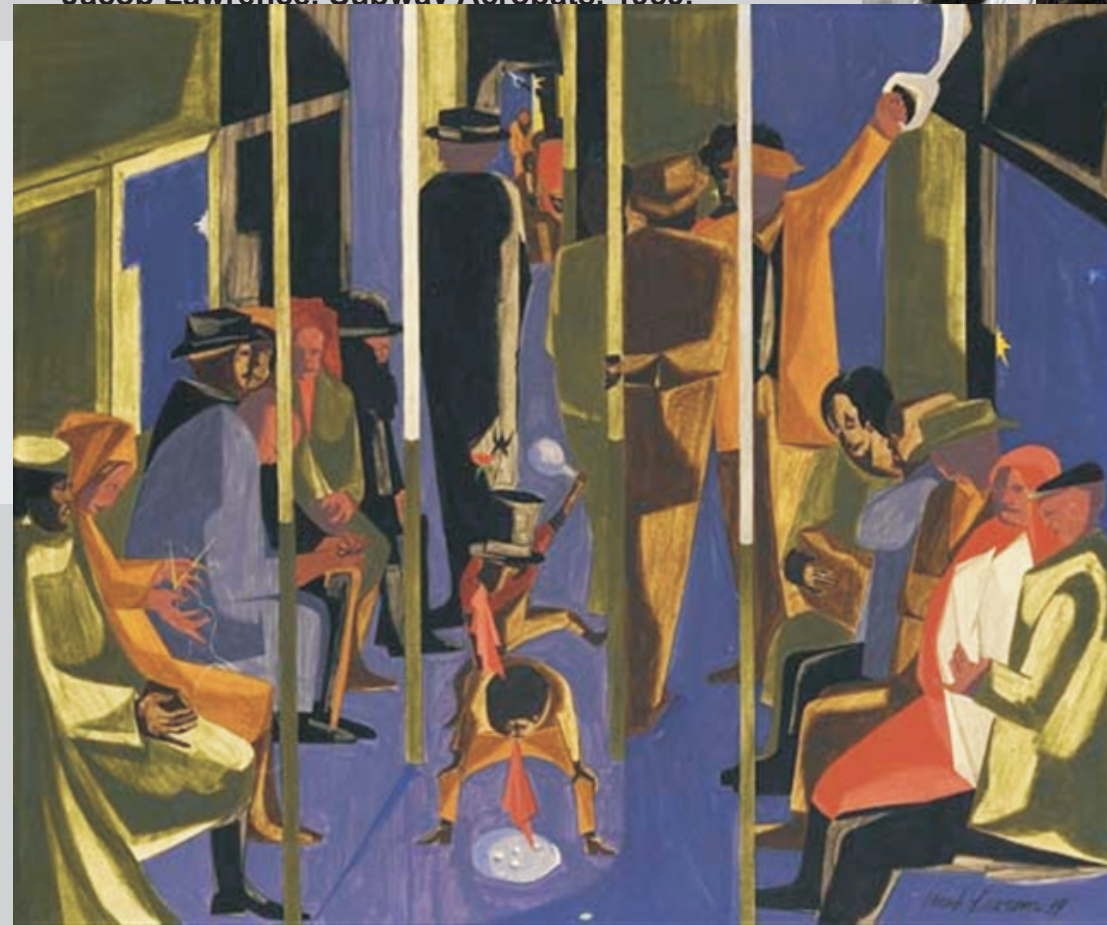
Jacob Lawrence. Subway Acrobats , 1959.