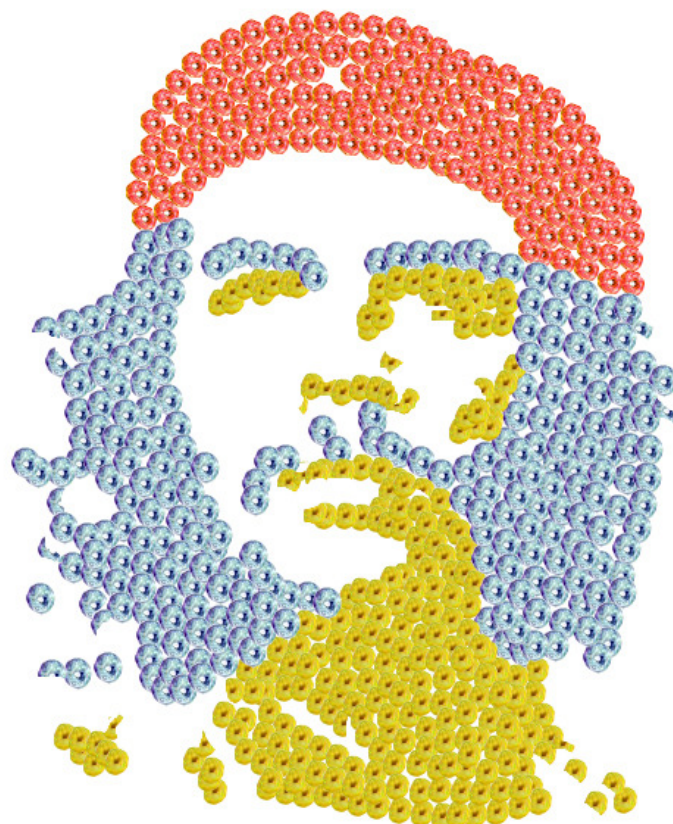
Celebrity Cereal Silhouette's Che Guevara & C-3PO