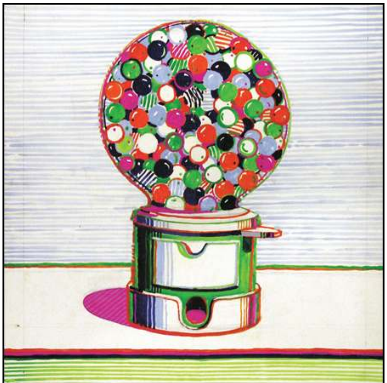
Wayne Thiebaud - Gumball Machine - Complimentary Colour Scheme (Red & Green)